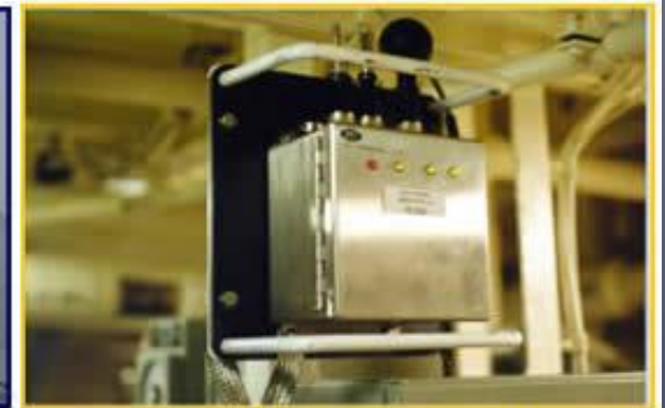
The Automated Heat Stress System (AHSS) measures dry bulb temperature, globe temperature and relative humidity, calculates the WBGT and displays PHEL stay times.