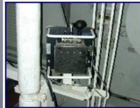
Monitoring equipment should not touch hot materials.